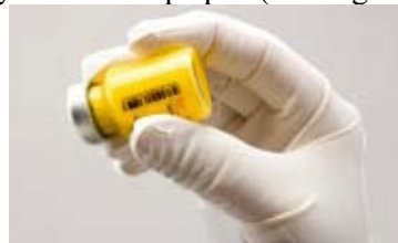
Figure C: Vigorously shake vial

If foam forms, let vial stand to allow foam to dissipate. If the product is not used immediately, it should be shaken vigorously to re-suspend. Reconstituted ZYPADHERA remains stable for up to 24 hours in the vial.