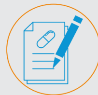
Image 2. Topics covered in the CTIS SME & academia online training module

Member State Master Trainers have received training on the SME & academia module to assist them in their national SME and academia support activities. The module will be central to the material presented at the SME & academia webinar, to be held on 29 th November .